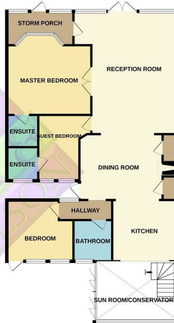
1ST FLOOR 1335 sq. ft. (124.0 sq. m.) approx.